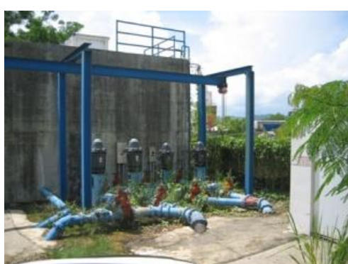
Water & Waste Water